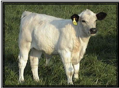
British White Cattle